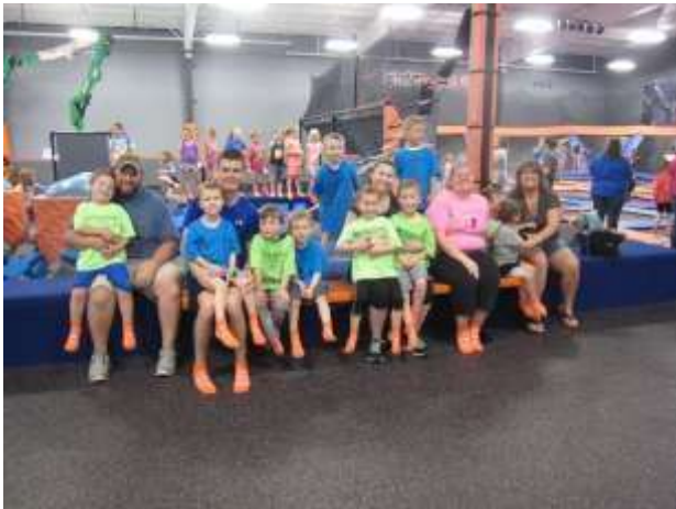
Sky Zone Fun Times!