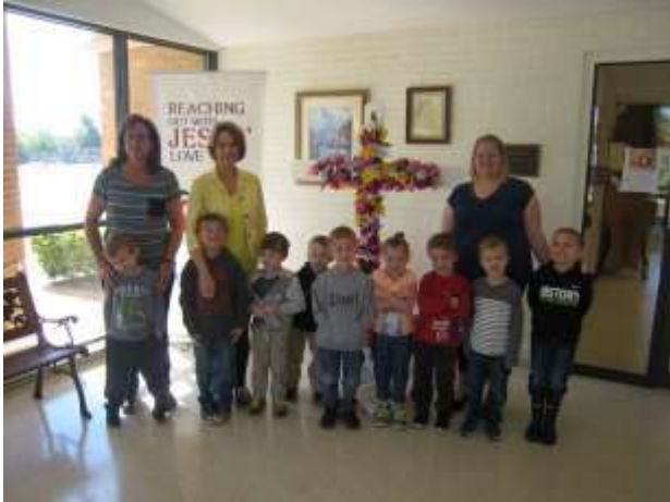
Our 2016-17 Graduating Class