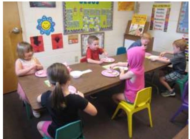
Creating our cookies for mom!

How fun to have our mom (and grandma) join each child for a special Mother's Day celebration on Friday. We enjoyed singing, snacking, and playing MOMMY-O BINGO!