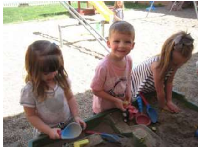
Sand Table Play