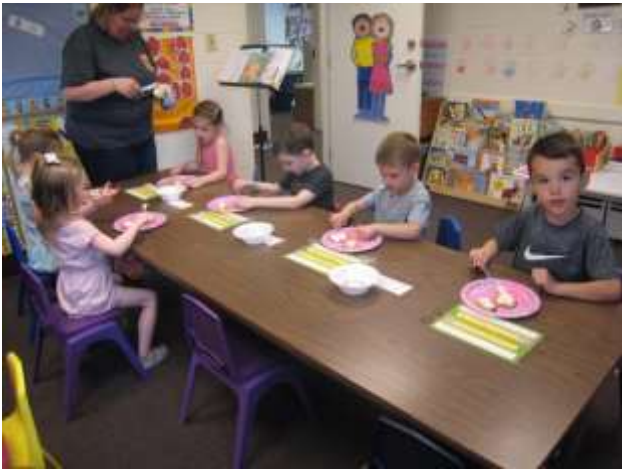
Making yummy cookies for mom!