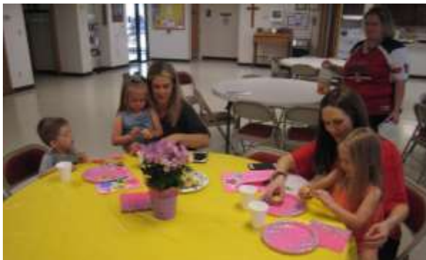
Sharing Muffins with our Moms