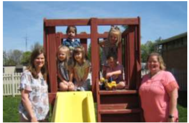
End of Year Picture

We certainly had a wonderful year together! Watching your children blossom from the first day until now, has been such a blessing to me! I am going to miss their morning smiles and loving personalities this summer, but look forward to seeing them again at Vacation Bible School, church, and/or next school year! Please stay in touch with me as your child holds a special place in my heart! Hope you all have a very blessed summer!