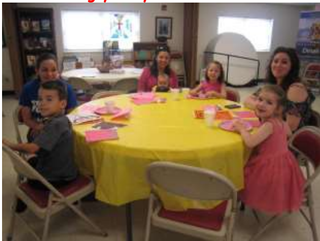
It's Mom time!