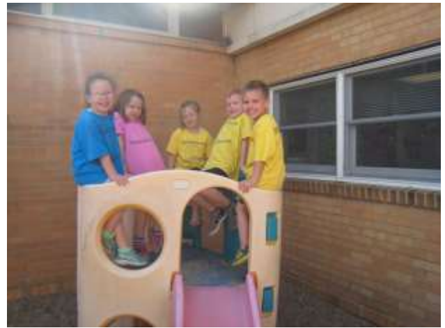
More playground fun