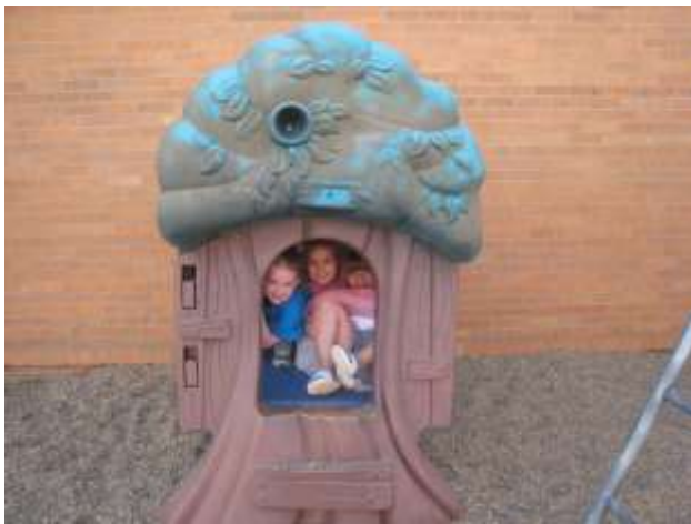
We love our tree fort!