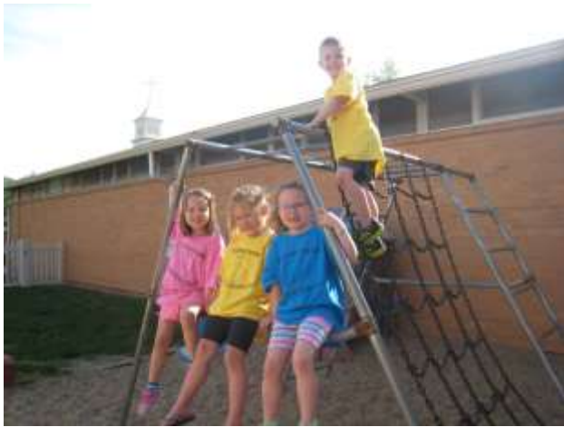
Fun with friends