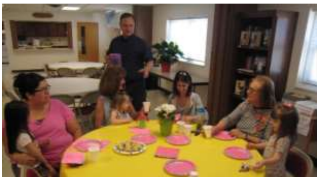
Loving our Moms and Grandmas