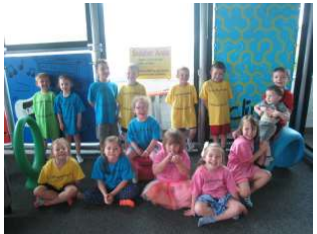
Field Trip fun at McDonalds Playland