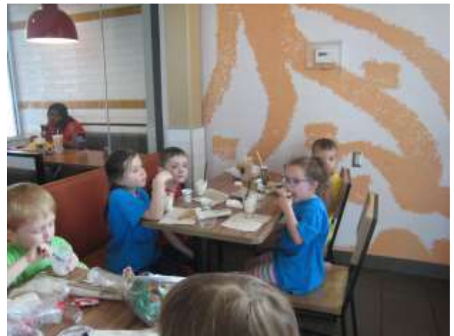
Snack time at McDonalds