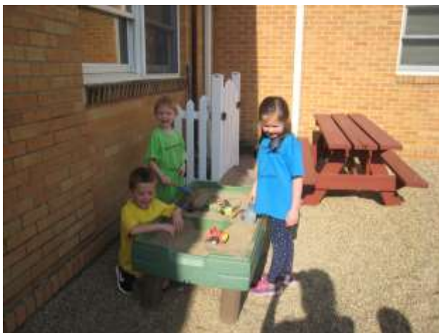
Fun in the sand